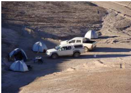
Field work: Mobile Camp (May 2010)

From the abstract of Berg & Tidy 2009. XII Chilean Geological Congress, Santiago, 22-26 November 2009