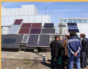
Energize the earth by the sun