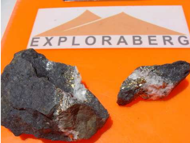
Sulphides of massive chalcopyrite with quartz and magnetite in Andesite, IV Region of Chile